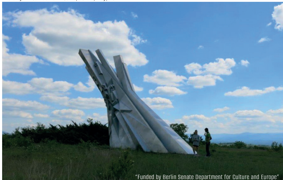
“Funded by Berlin Senate Department for Culture and Europe”